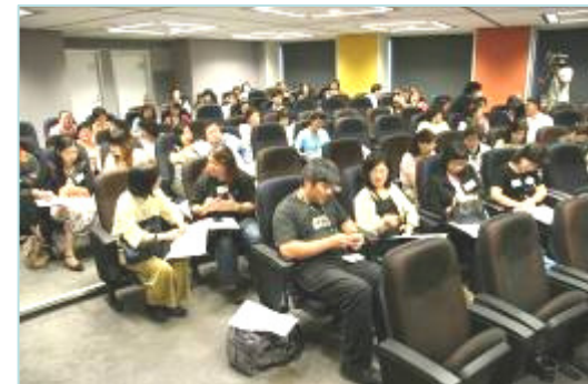
WOMEN UP II Product Show